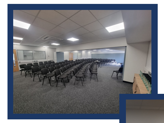
**Approx number of people in Classroon style 120 people

To book your next event, or for more information contact the Events Team on 01923 695295 or email events@ukcows.com